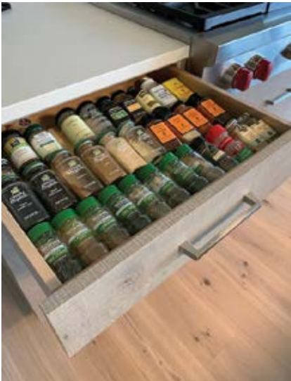
Idea House spice drawer