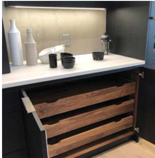
Idea House walnut pullouts